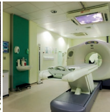
BEATSON CANCER CARE CENTRE