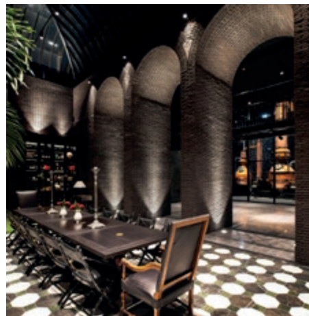
HENDRICK'S GIN PALACE